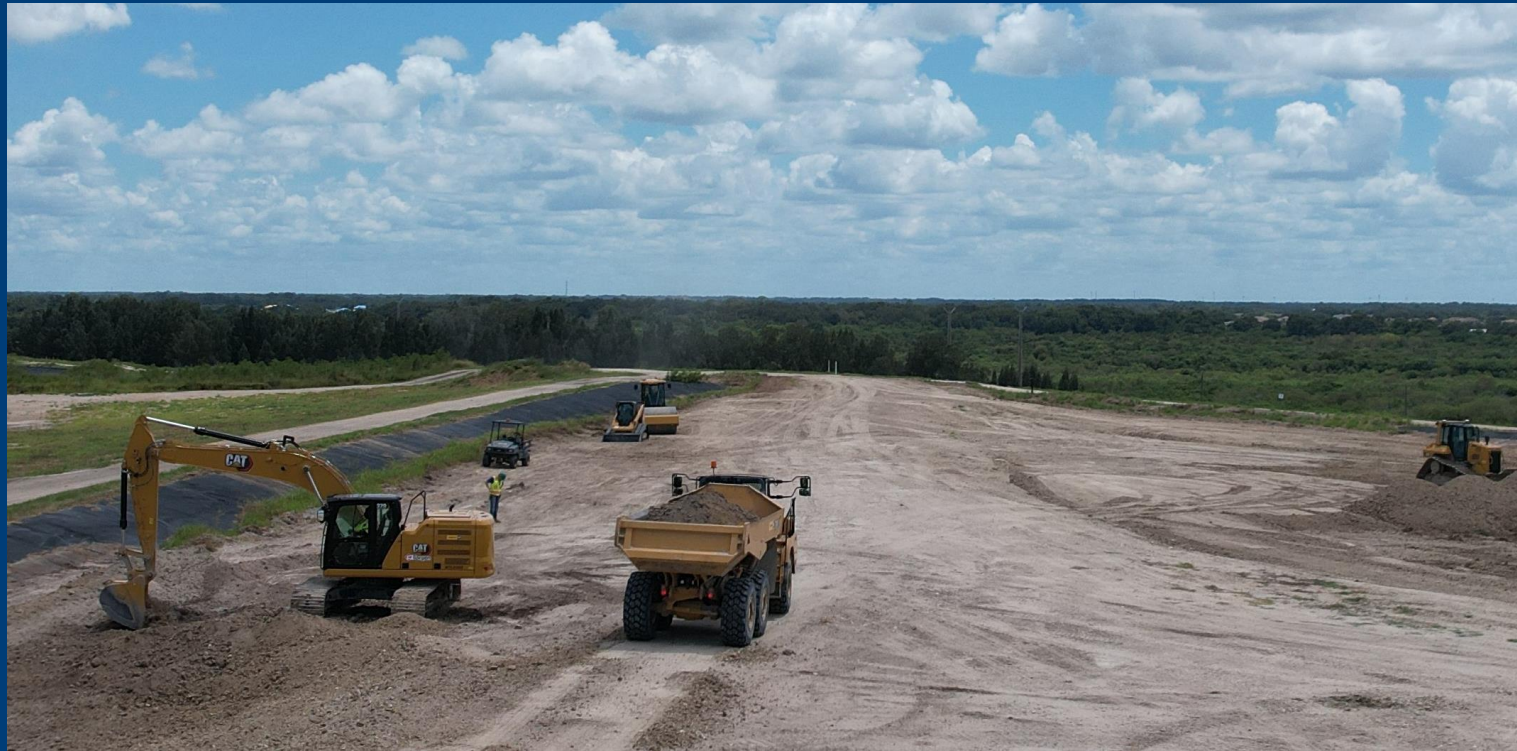
View of ongoing work inside OGS-S with placement of fill, grading, and compaction prior to new liner installation.